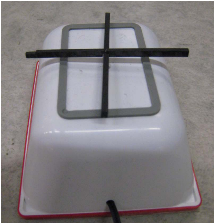
Fig 1. Overview of the air cleaner, from above.